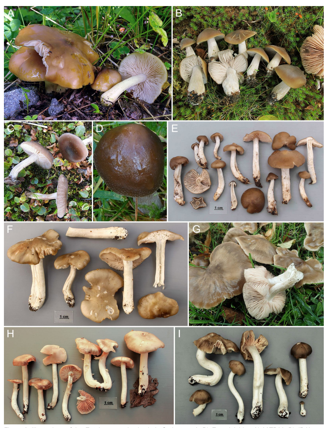
Figure 2. Illustrations of the Entoloma species in clade Sericatum. A, B) E. majaloides, A) 92TB09, B) JBJ6457; C, D, E) E. sericatum, C) JL65-16, D) MP10.11.09, E) TEB 390-15/DB5790; F, G) E. lividoalbum, F) TEB 610-15, G) ØW21-17; H, I) E. noordeloosii, H) TEB 62a-16, I) TEB 315-17.